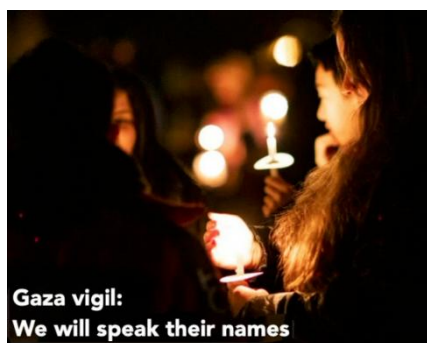
Gaza vigil: We will speak their names

Date: 23 rd September Time: 6:30pm Location: St Carthage's, Parkville