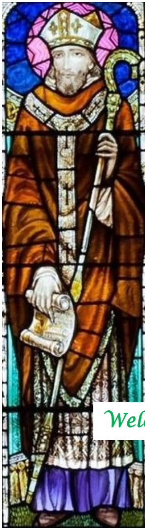
St Carthage (Mochuda)

Liturgical updates: Covid-19 guidelines | The Catholic Archdiocese of Melbourne (melbournecatholic.org)