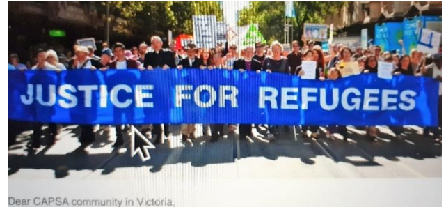
Dear CAPSA community in Victoria,

* This event is organised by The Refugee Advocacy Network (For enquiries contact 0409 252 673)