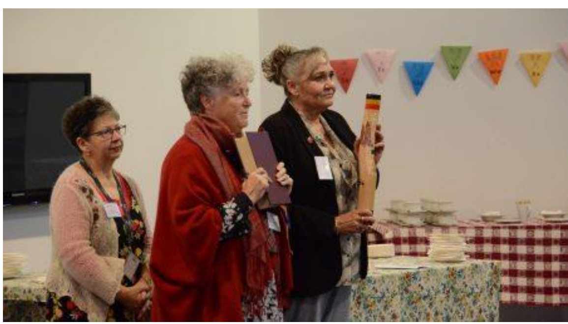
Social Services Sunday, 19 September

We call to mind the recent <u>2021/22 Social Justice Statement</u> – Cry of the Earth Cry of the Poor – released by the Australian Catholic bishops, which reminds us of the social mission of the Church and which urges us to reflect on 'the bigger picture' and to act together on social, economic and ecological issues. Together, we all have a role to play in building a just and equitable society, where all have equal opportunities to flourish and prosper.