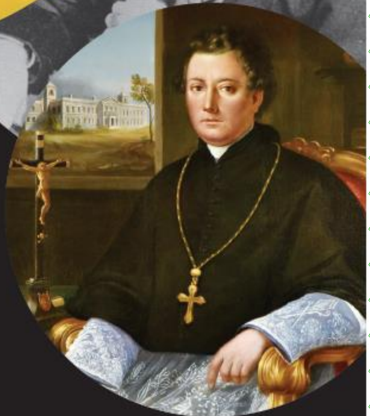
James Goold, first Catholic Bishop of Melbourne Portrait c1859, from the collection of the Religious Sisters of Mercy Melbourne

An exhibition at THE OLD TREASURY BUILDING