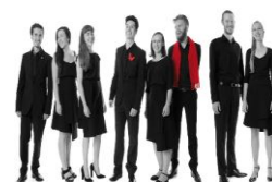
AUSTRALIAN CHAMBER CHOIR

* An ensemble from the Australian Chamber Choir will sing at the 5pm Student Mass.