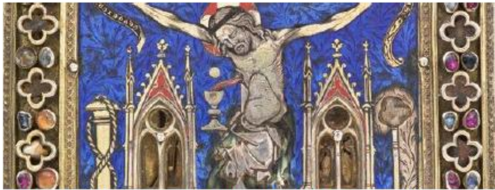
Table reliquary of the Crucifixion with Instruments of the Passion, mid-fourteenth century. Enameled silver and precious stones.