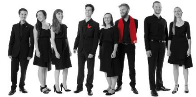
AUSTRALIAN CHAMBER CHOIR

→ An ensemble from The Australian Chamber Choir will sing at the 5pm Student Mass.