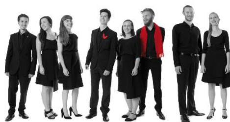
AUSTRALIAN CHAMBER CHOIR

➔ The Australian Chamber Choir returns from their European Tour. An ensemble from the Choir, will sing at the 5pm Student Mass.